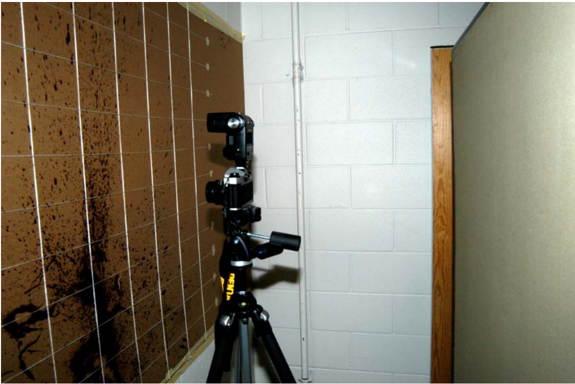
Figure 4: 4" x 6" grid, 1' from wall