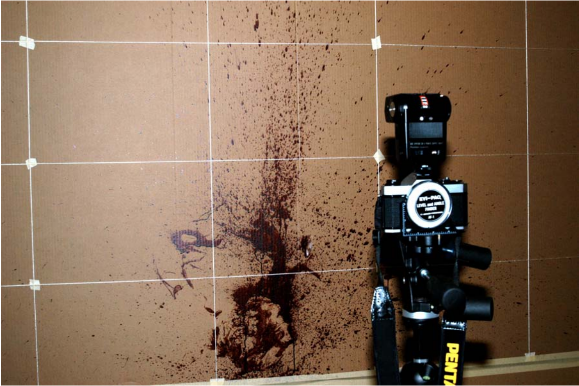
Figure 3: 12" x 18" grid, 3' from wall